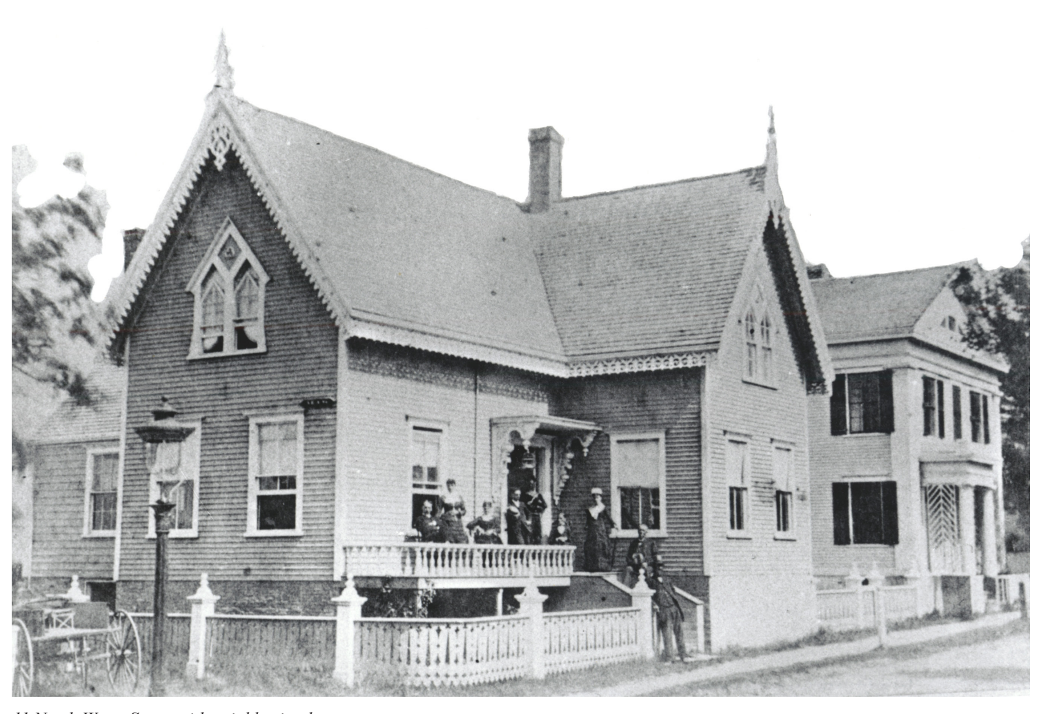
11 North Water Street with neighboring house