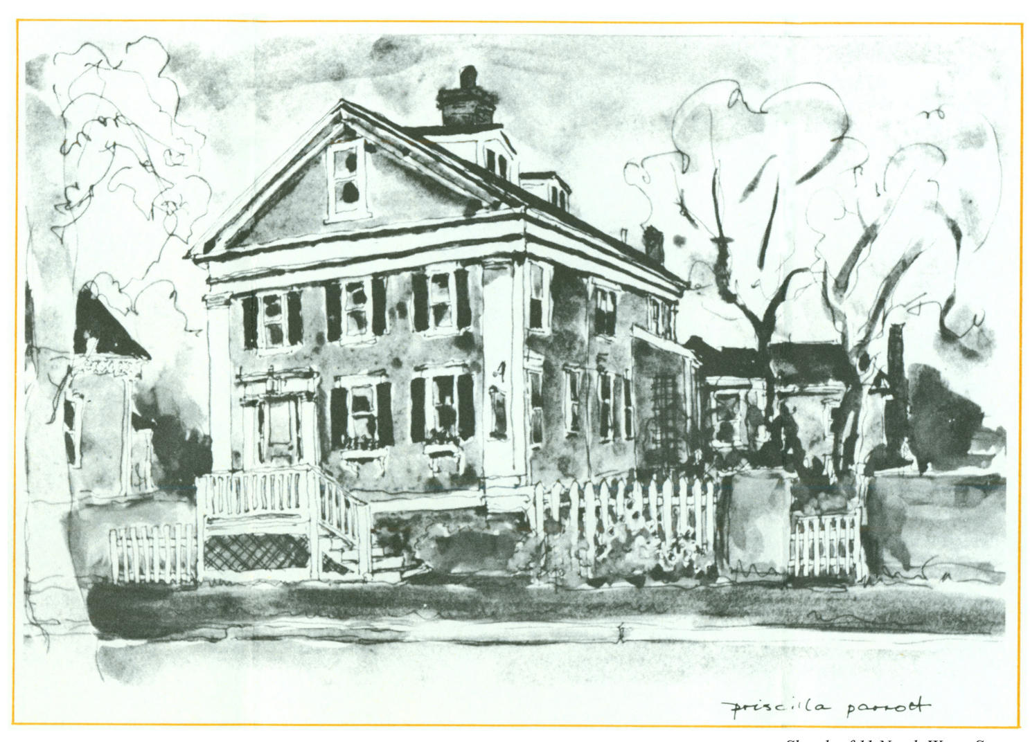
Sketch of 11 North Water Street