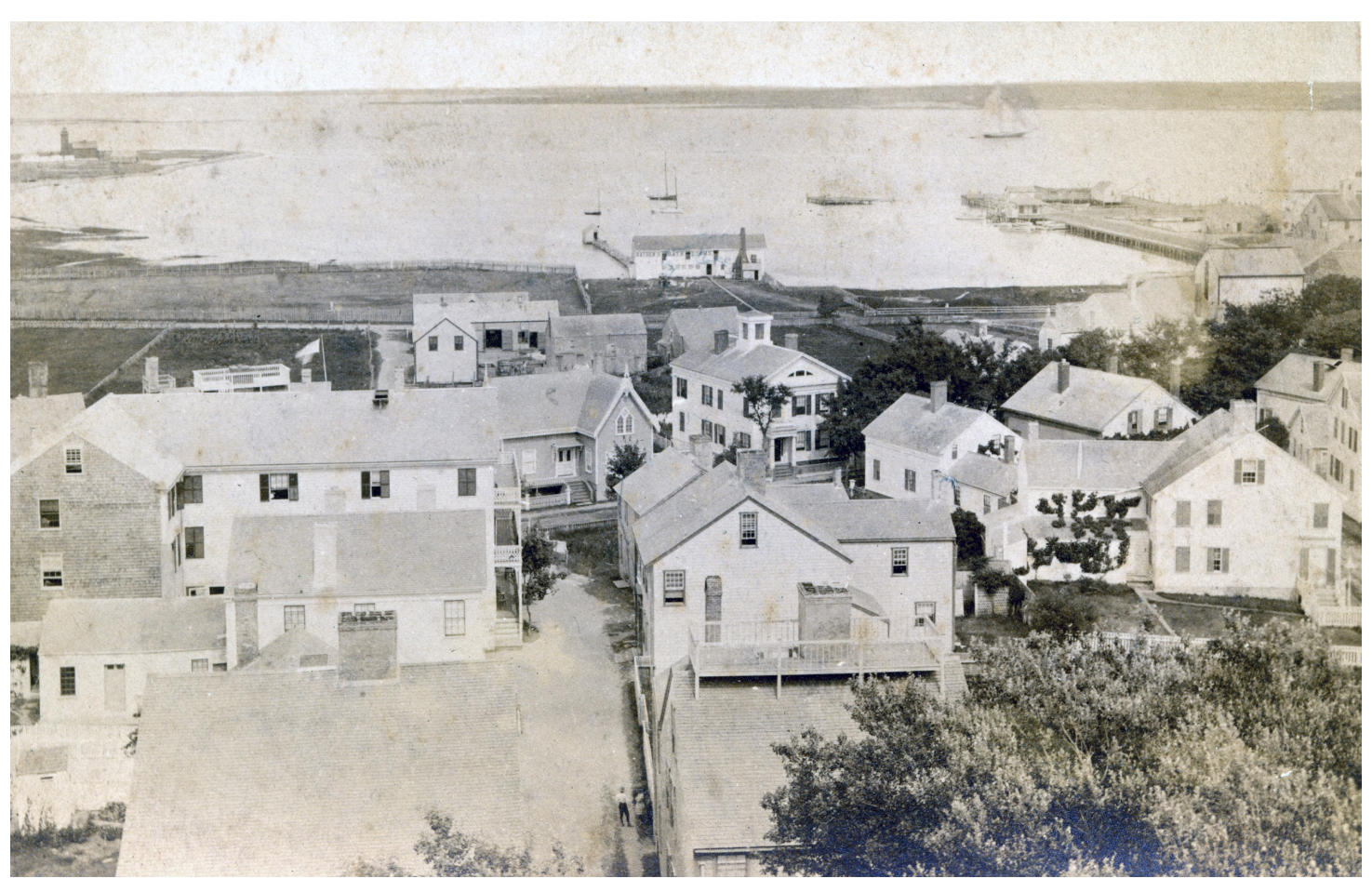
View from North Church Tower with 11 North Water Street (center), c. 1880s