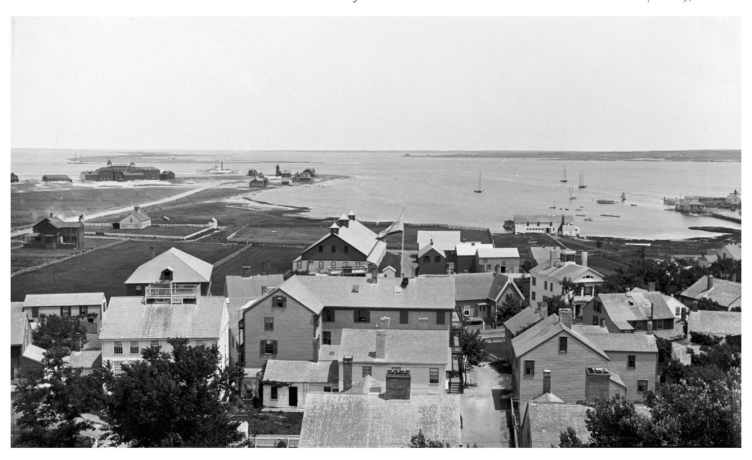
View from North Church Tower with 11 North Water Street (center right), c. 1890s